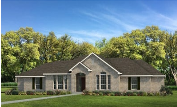
Elevation B - The Preston