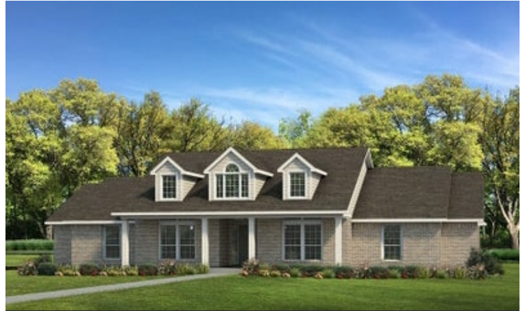
Elevation C - The Preston