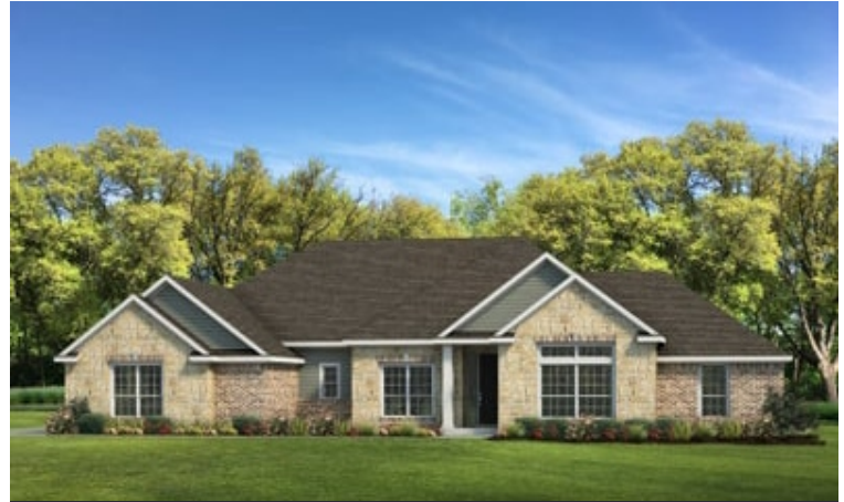
Elevation B - The Fredericksburg