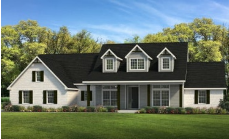
Elevation C - The Fredericksburg