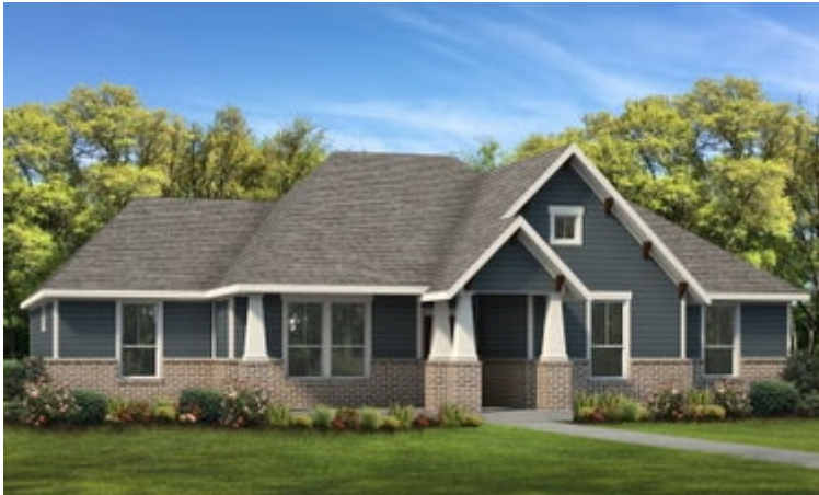
Elevation B | The Angelina