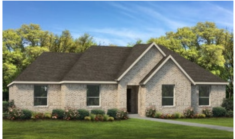
Elevation A | The Angelina