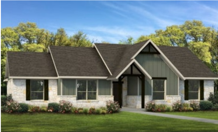
Elevation D | The Angelina