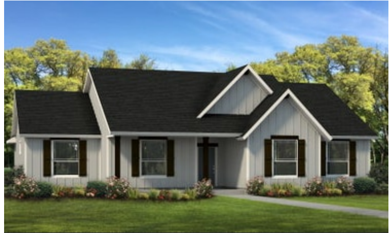
Elevation C | The Angelina