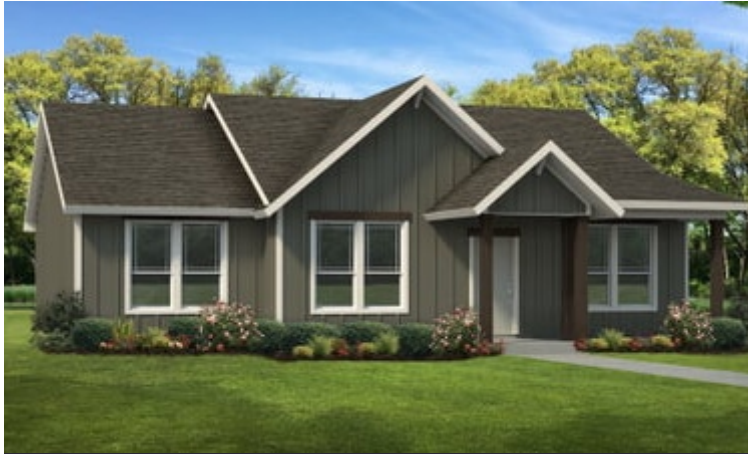
Elevation C - The Rio