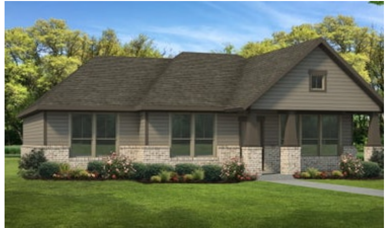
Elevation D - The Rio