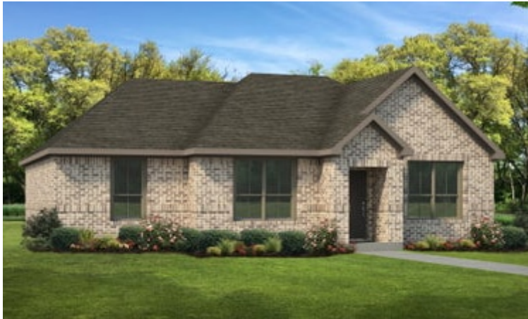
Elevation B - The Rio