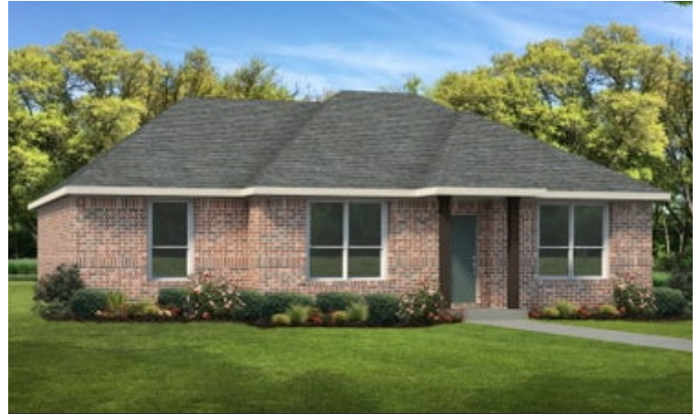
Elevation A - The Rio