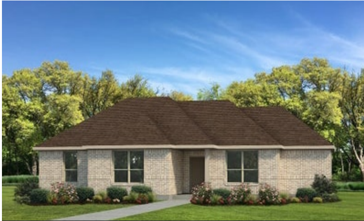
Elevation A - The Nacogdoches