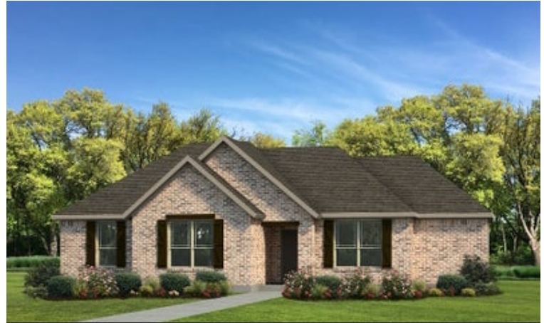
Elevation B - The Nacogdoches