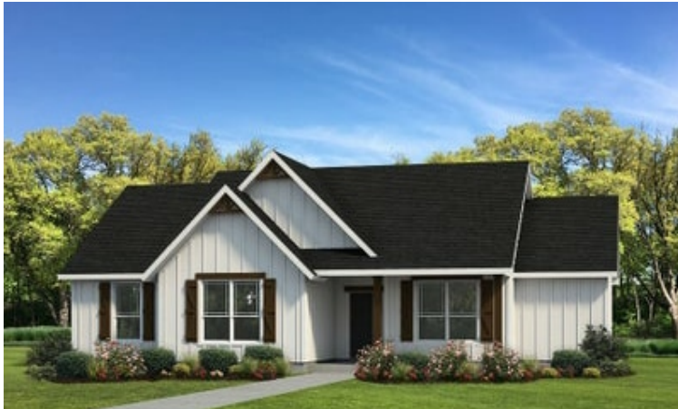
Elevation C - The Nacogdoches