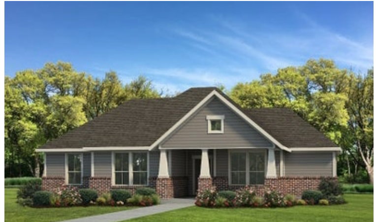
Elevation D - The Nacogdoches