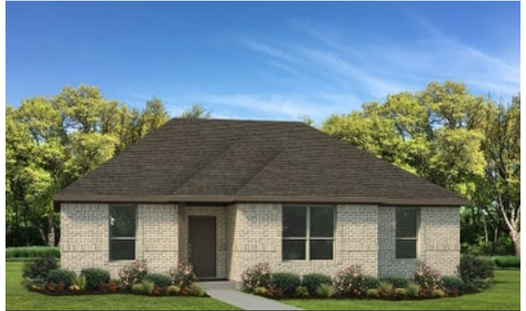
Elevation A - La Porte