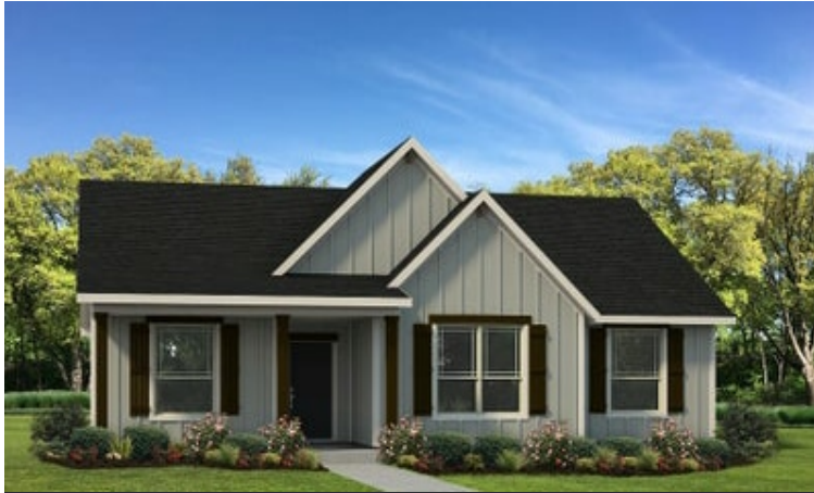
Elevation C - La Porte