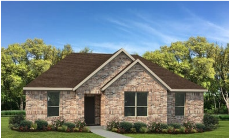
Elevation B - La Porte