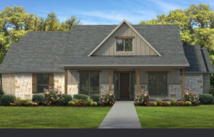
Elevation D - The Fayetteville