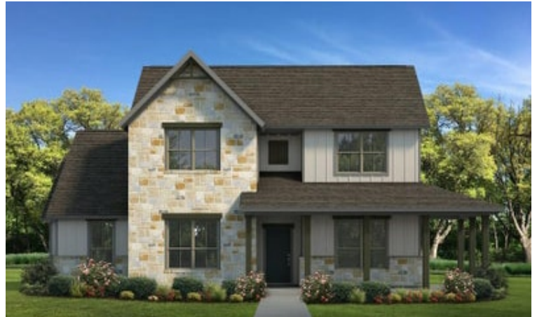
Elevation D | The Cedar Creek