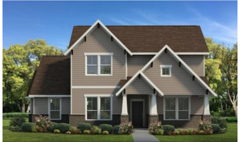
Elevation B | The Cedar Creek