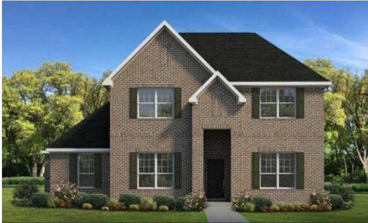
Elevation A | The Cedar Creek