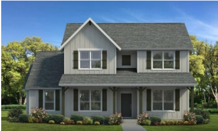
Elevation C | The Cedar Creek