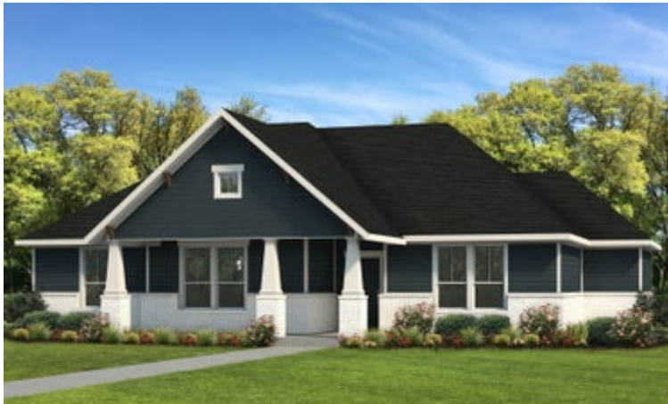
Elevation B | The Canyon