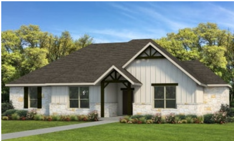
Elevation D | The Canyon