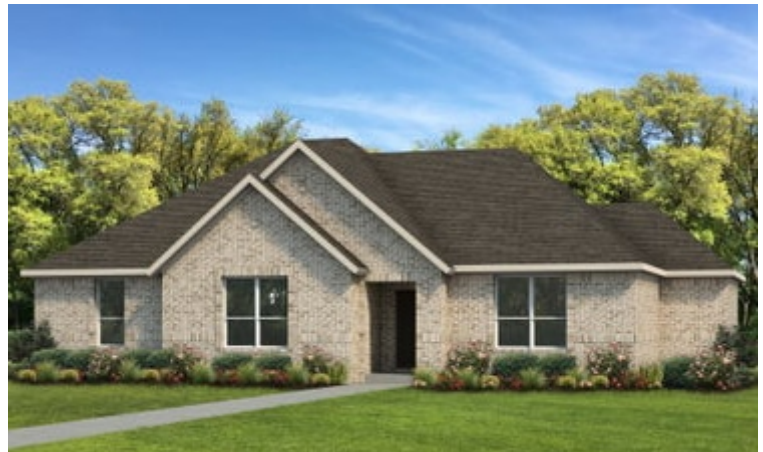
Elevation A | The Canyon