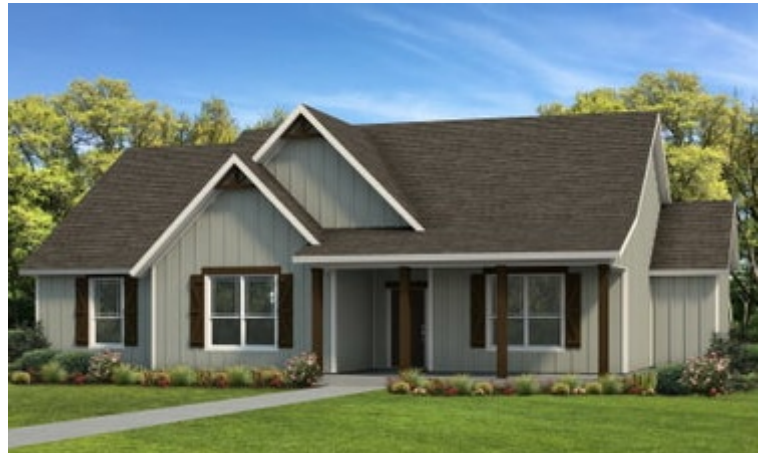
Elevation C | The Canyon