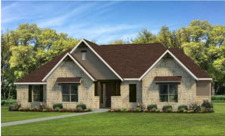
Elevation D | The Barton Springs