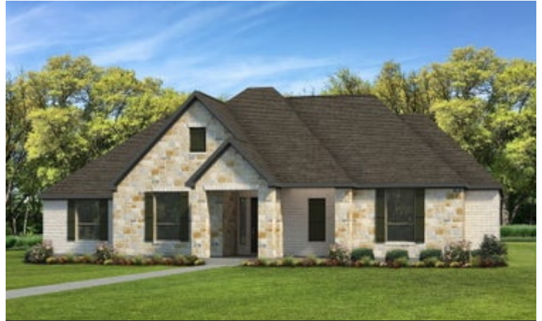
Elevation A | The Barton Springs