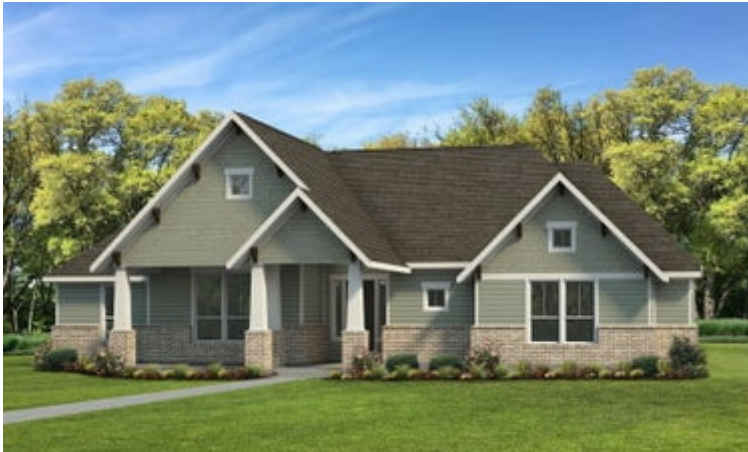
Elevation B | The Barton Springs