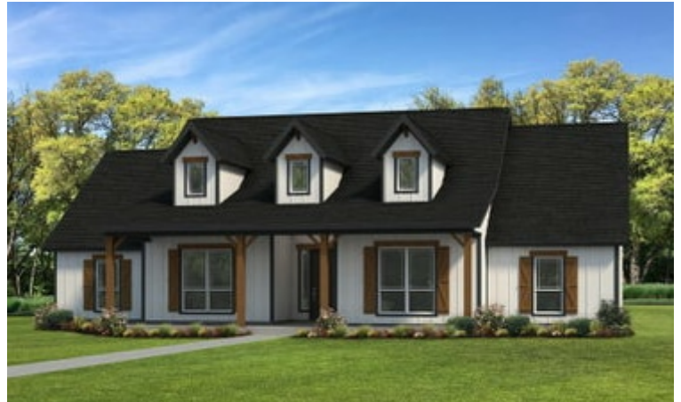
Elevation C | The Barton Springs